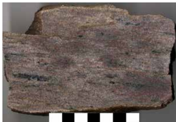
Photograph of a diamond saw cut surface of a rare earth element (REE) mineralised rock from Otanmäki, central Finland. Scale bar is in cm.

Kimmo Kärenlampi, Geologist at Oulu Mining School in Finland, said, "The X-MET8000 Expert Geo portable XRF analyser is a valuable tool for geological exploration and mineral resource studies because of its versatility to analyse several geologically-important elements reliably and fast."