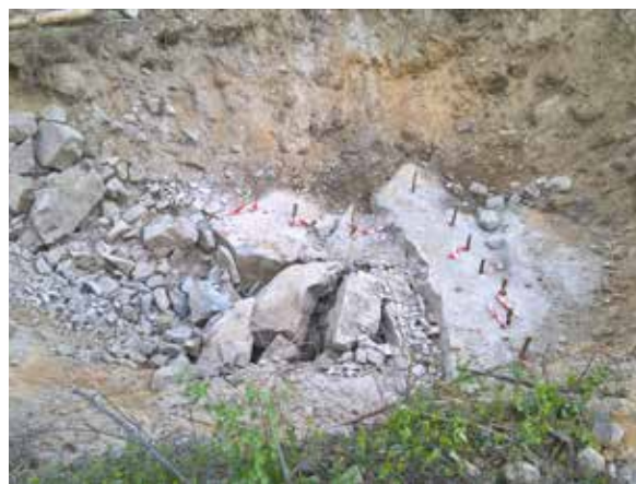
Geological exploration for rare earth elements at Otanmäki, central Finland. Blasting a representative sample from a rare earth element deposit for mineral processing studies.

Screening analysis can be made from rocks and drill cores as such and the use of the X-MET’s averaging function gives directly representative average results. For more accurate results, the samples need to be ground, dried, sieved and put in a sample cup with a thin polypropylene film before analysis. The grinding process is crucial because variation of the sample particle size causes heterogeneous layers in the sample cup leading to erroneous results.