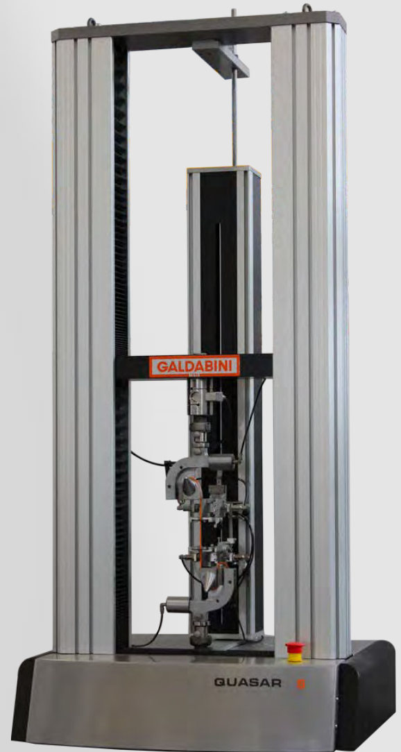
Universal testing machine Quasar 5 with Micron extensometer