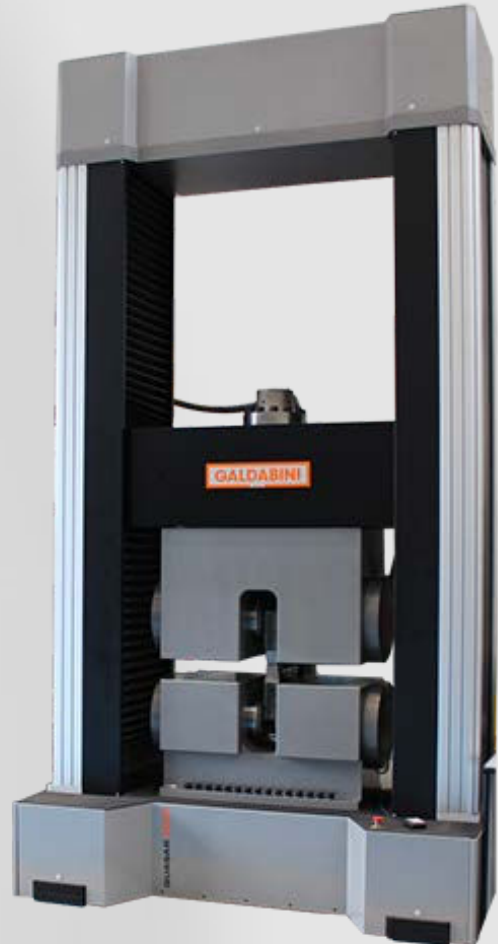
Universal testing machine Quasar 2000 with Hydraulic parallel closing grip