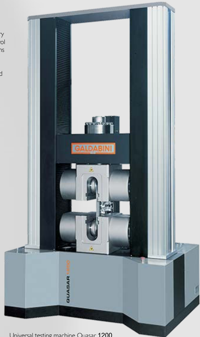
Universal testing machine Quasar 1200 with Hydraulic parallel closing grip and "Micron" extensometer