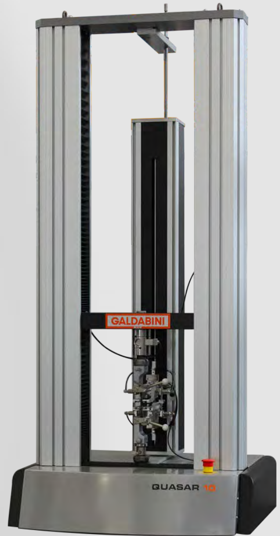
Universal testing machine Quasar 10 with Micron extensometer

In addition, this user-friendly instrument can be fitted with additional load cells with lower capacities, providing the highest resolution and accuracy for micro-loads.