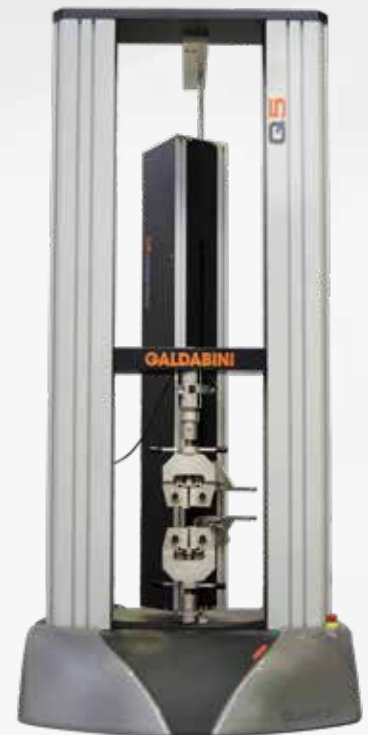
Universal testing machine Quantum 5 with Micron extensometer

In addition, this user-friendly instrument can be fitted with additional load cells with lower capacities, providing the highest resolution and accuracy for micro-loads.