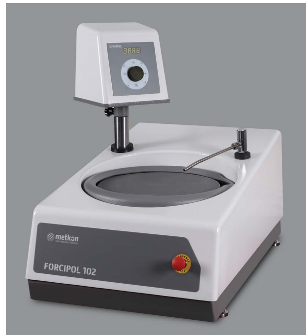
FORCIPOL 102 with Control Unit

Enviro Filter Unit is a closed loop recirculating filter system which is optionally available. It has a 20 lts. reservoir capacity with 1 micron