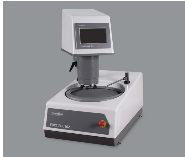
FORCIPOL 102 with FORCIMAT 102

The "soft start and stop" feature automatically starts the sequence with a low initial force which is then increased to the preset. Towards the end of the cycle, the force is automatically reduced to 75 % of the setting to prevent scratching. A variety of sample holders for individual or central force applications are available for different sample sizes. Both individual and central force specimen holders can be removed and inserted easily with the help of quick release chuck. By holding the head button on the software, the specimen holder will rotate for easy insertion and removal of the specimens.