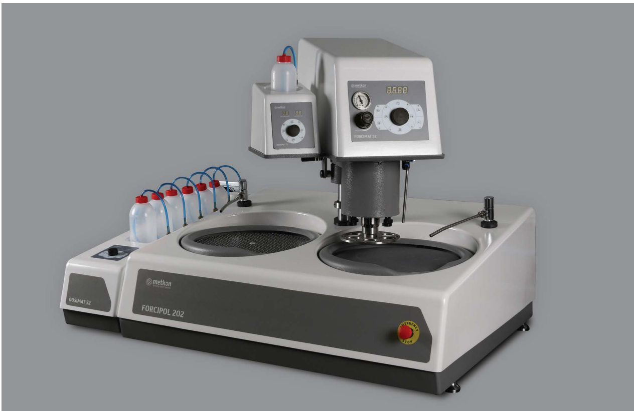
FORCIPOL 202 + FORCIMAT 52 + DOSIMAT 12 + DOSIMAT 52

Dispensing parameters like; frequency, dosing time, fluid selection etc. are controlled through the LCD screen of the FORCIMAT 102 Automatic Head and can be stored in memory.