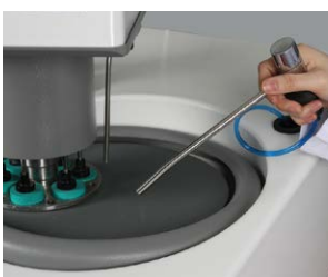
Retractable water hose for easy cleaning

filter entering the grinder / polisher intake. Enviro can also be coupled with line water and 80 micron filtering system for disposal.