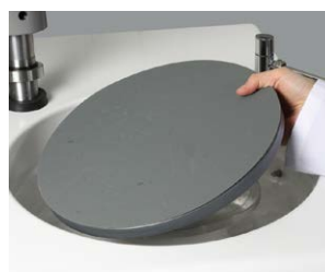
Simple exchange of working discs