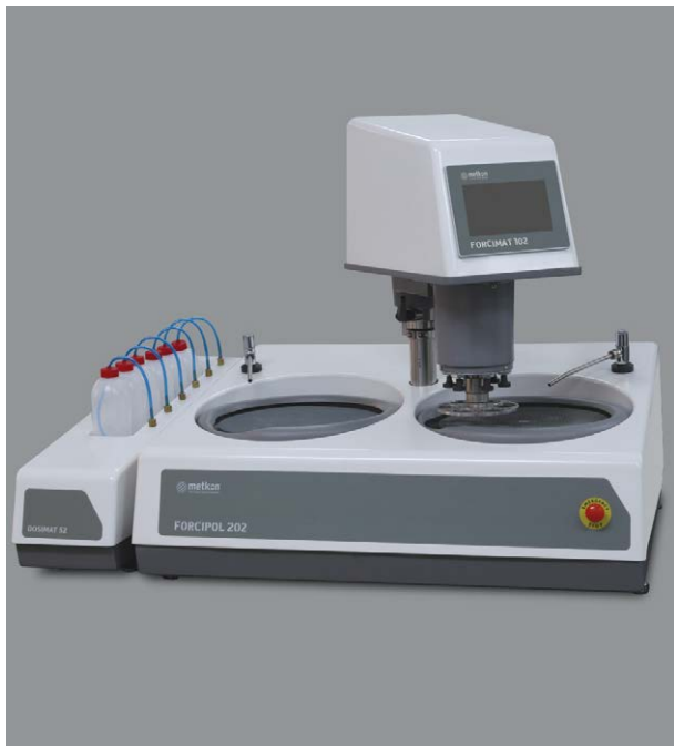
FORCIPOL 202 with FORCIMAT 102 & DOSIMAT 12

Optional encoder allows you to measure the amount of material removed from the surface. The desired grinding depth can be set to grind different type of samples and also for applications that need special accuracy.