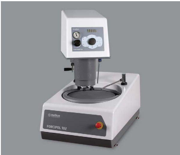
FORCIPOL 102 with Forcimat 52

When needed, FORCIMAT 52 can work in manual mode to allow prepare specimens by hand.